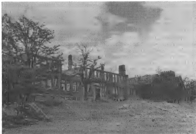
Church and School at Phyöngyang

Members were able to learn something about the methods by which the city has been destroyed. They were told that the town had been raided ever since the beginning of the war. The worst of these raids took place on January 3rd, 1951. On this occasion the town was bombed by 80 American B-29's. They came in a series of waves, at intervals of 15 or twenty minutes, starting on the evening of the 3rd and continuing till noon of the following day. The attack began with incendiaries. Next came a series of bombs which were described as being like balloons filled with petrol. Then followed a wave of high explosives and after that came another series of incendiaries interspersed with time-bombs. The fires caused by the incendiaries and the explosions caused by the time bombs prevented the inhabitants from doing any systematic rescue work and